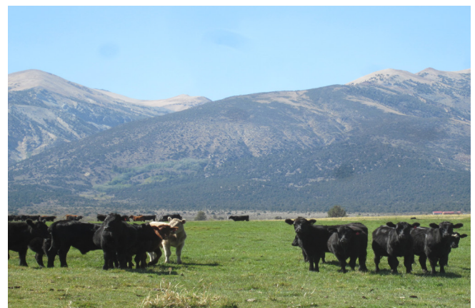
The Masinis raise black angus yearling "stockers" in the irrigated meadows. The meadows are broken up into 28 pastures to keep the cattle on the move and sustain the grass resource.

In recent years, the Masini family has taken big strides to protect and preserve sage grouse habitat on more than 4,150 acres of private lands via conservation easements, pinyon and juniper removal, fencing improvements and range management through the Sage Grouse Initiative (SGI). The SGI is a national partnership led by the Natural Resources Conservation Service that aims to proactively conserve sage grouse habitat on private ranchlands in 11 Western states. The Masini's are one of the first ranch families in the region to work with the NRCS to receive cost-share funds and expert advice to conserve sage grouse and improve the sustainability of their ranch.