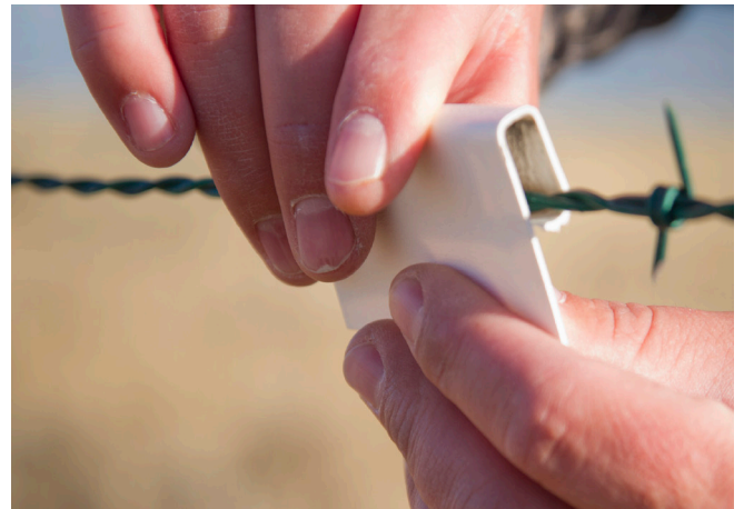
On the Sweetwater Ranch, reflectors like this one make fencing sage grouse friendly.

Beyond the specific habitat improvements, the conservation easements that cover the Sweetwater Ranch bring everything