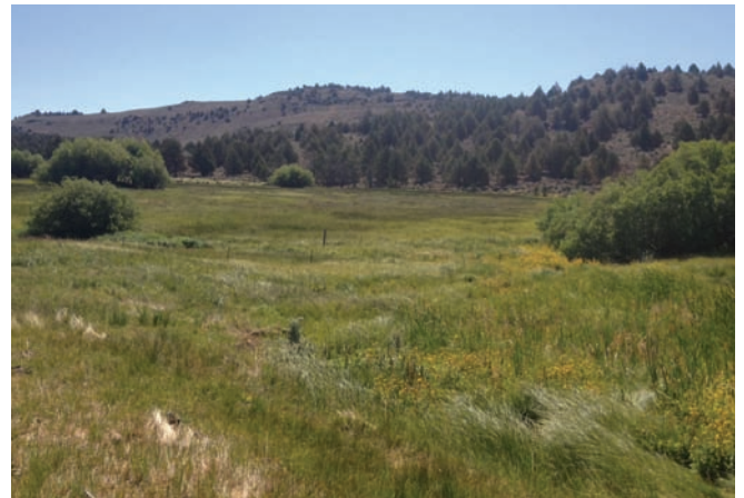
Protecting and managing Horse Lake Meadow as a lush oasis for sage grouse broods is important to bird survival. The meadows also shelter sandhill cranes, waterfowl, and shorebirds.

“The intent is to allow for nesting cover for sage grouse and minimize disturbance during the nesting season,” says Nate Key, Wetland Reserve Program team leader for the NRCS in Yuba City. The meadows also attract and support sandhill cranes, migratory waterfowl and shorebirds.