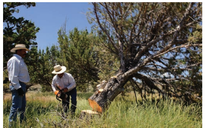
In most cases the Swickards cut smaller junipers, but larger ones did come down where they posed a threat to sage grouse in otherwise open country. Trees offer perches for predators.

T he contractor sold the chips to a co-generation plant as an energy resource, reducing the overall cost of the treatments. Normally juniper removal costs $80-$250 per acre. The Honey Lake biomass/geothermal plant provides local power to the Susanville area, and in the summer of 2012, the plant played a big role when PG&E had numerous outages because of wildfires. The Honey Lake plant kept the lights on during the outages,